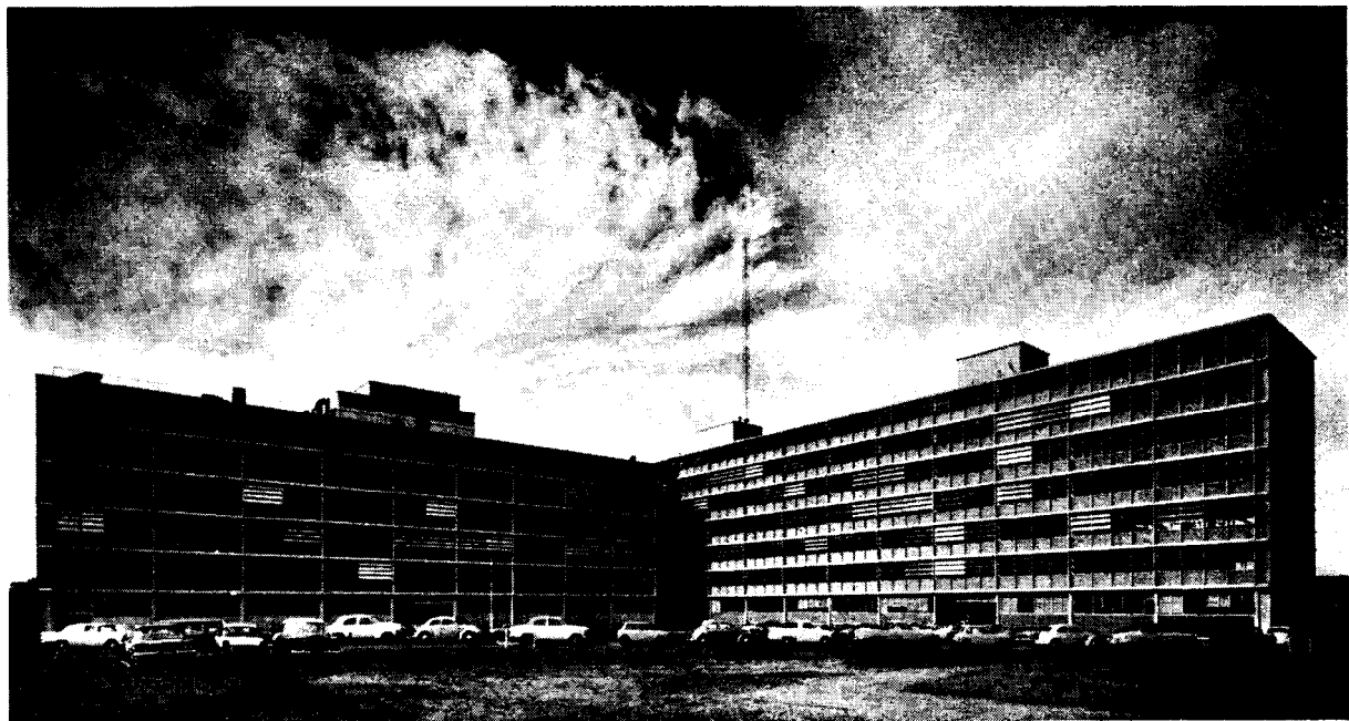
THE WALLACE WURTH SCHOOL OF MEDICINE (on the left) AND THE SCHOOL OF BIOLOGICAL SCIENCES (on the right).